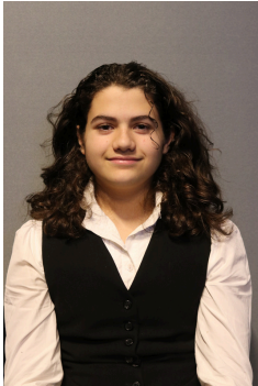
Ocean Moses Ensemble